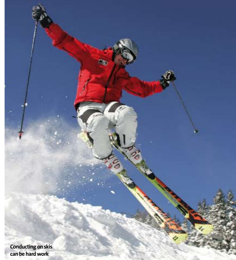
Conducting on skis can be hard work

0043 3687 23310 www.schladming-dachstein.at