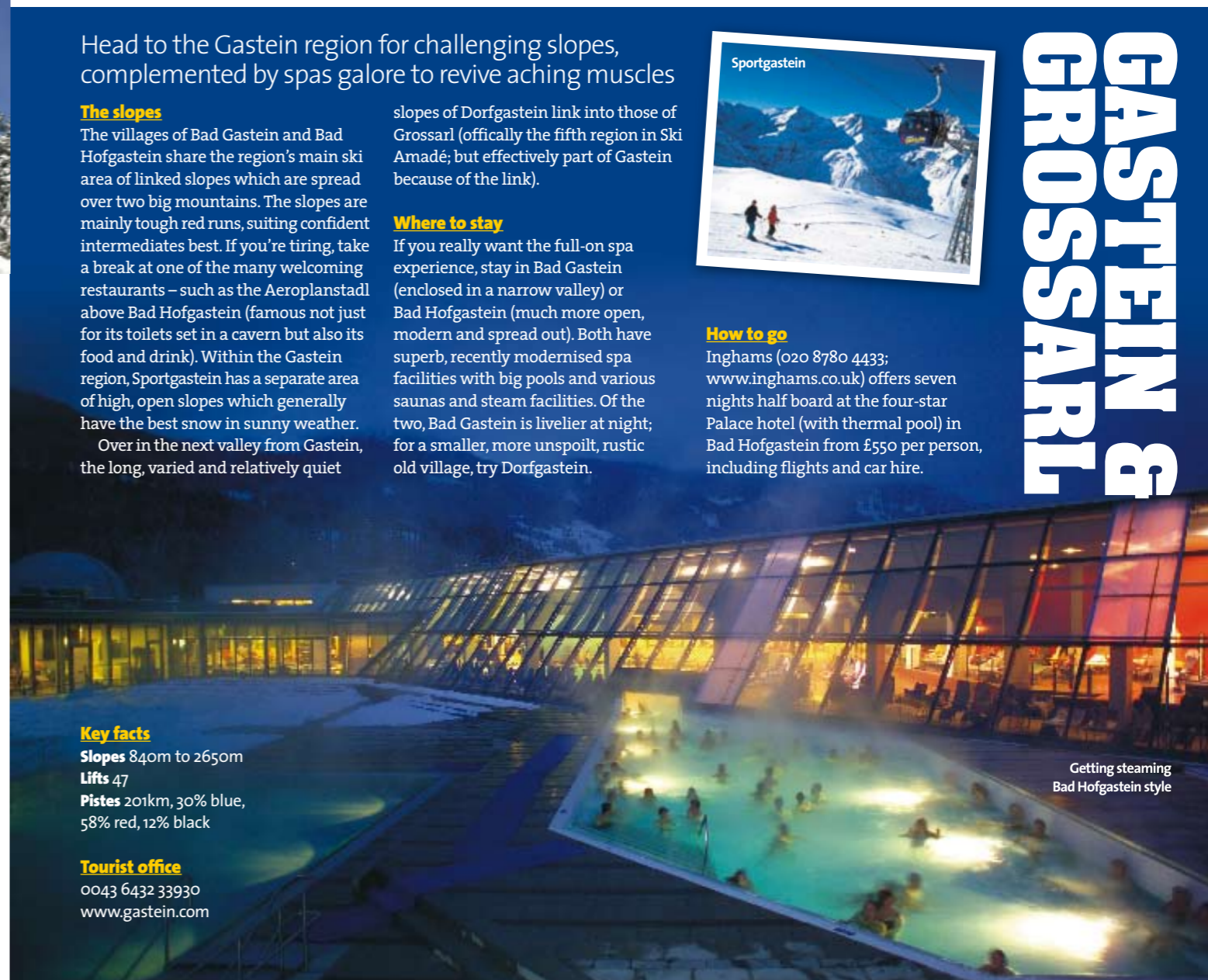
Getting steaming Bad Hofgastein style